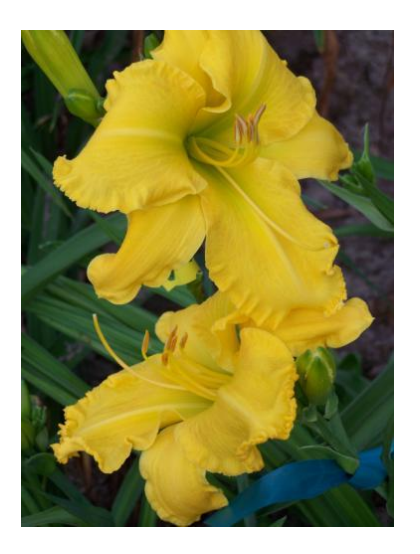
Stand and Shout (Gerald Hobbs)