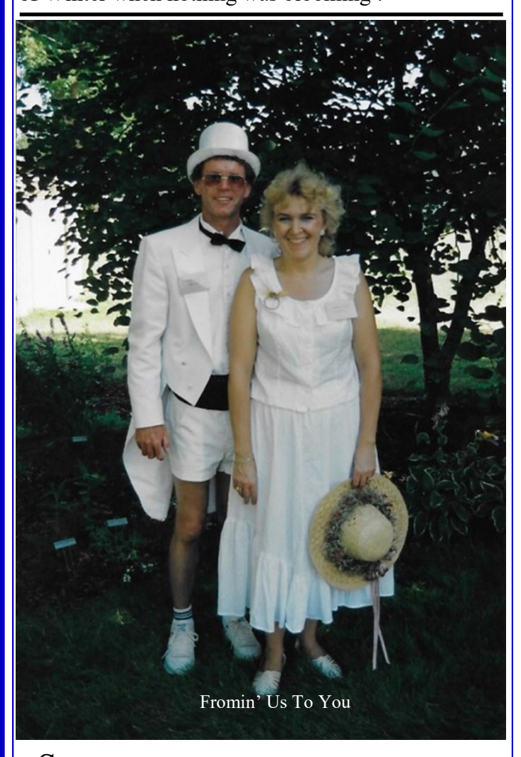
So... Have Fun! Stay Healthy! Keep In Touch!

10 Counted at one time in our backyard in the death of Winter when nothing was blooming!