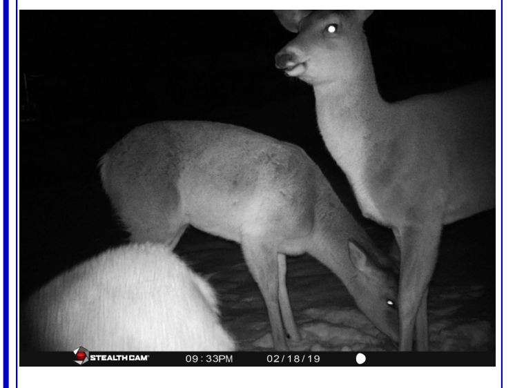
<u>StealthCam Image: 02/18/2019; 9:33 pm; Our BackYard</u> Backyard Non-Invited Guests: 3 This Time;

10 Counted at one time in our backyard in the death of Winter when nothing was blooming!