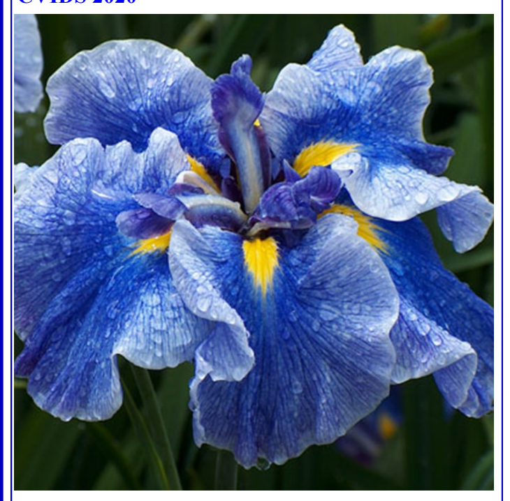
Japanese Iris: Jaciva