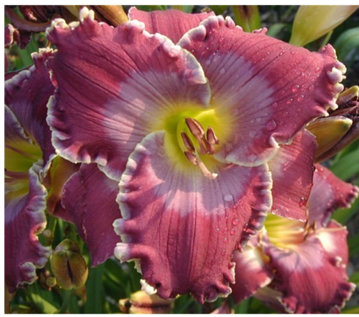
May Club Plant Distribution