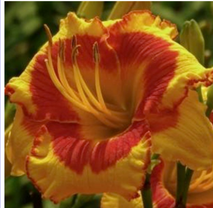
May Club Plant Distribution