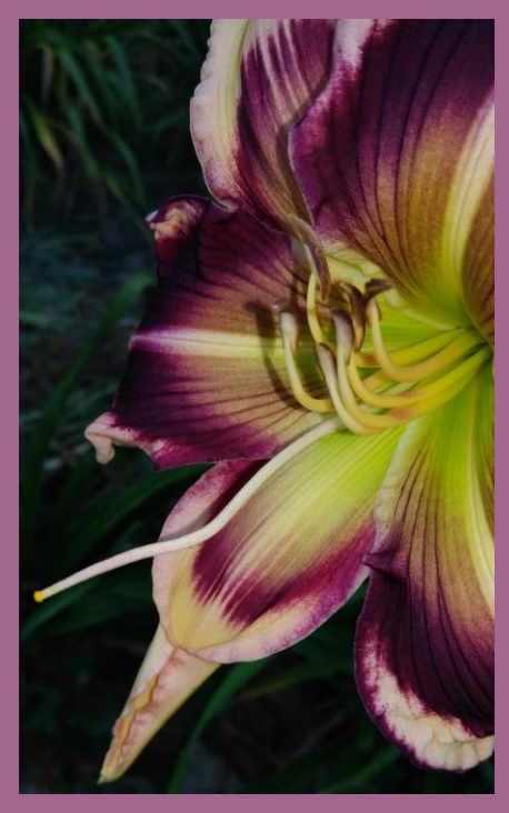
8" flower, rebloom, good branching and bud count.

Unknown parentage. Drop dead gorgeous but, so far, no pollen and unable to set pods.