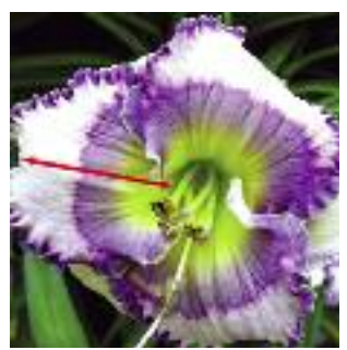
Hemerocallis 'Rhapsody in Blue' (Faulkner, 2013) with transect illustration — Phil Reilly photo with Jonathan Poulton illustration

daylily cultivars, we may find valuable information that could facilitate creation of a true blue self by either conventional breeding or genetic engineering. Nowadays, scientists have highly accurate methods for the analysis of anthocyanins, colorless flavonoids, vacuolar pH, and metal ions in small amounts of plant tissue. Thus, for example, a wellequipped laboratory could measure these components in tiny tissue samples taken along a transect in Faulkner's 2013 introduction 'Rhapsody in Blue' (Faulkner, 2013). These studies may provide evidence for one or more of the five strategies employed by other blue-flowered species. Alternatively, it