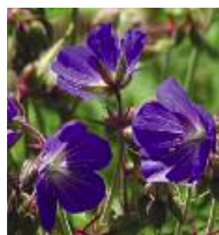
Geranium 'Johnson's Blue'

contains six cyanidin-based anthocyanin molecules, six flavone molecules, and two metal ions (one ferric [Fe^{3+}] and one magnesium [Mg^{2+}] ). In contrast, the metalloanthocyanin in the Asiatic dayflower that I used as blue standard in my photography has six delphinidinbased anthocyanin molecules, six flavone molecules, and two Mg^{2+} ions.