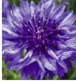
Blue cornflower ( Centaurea cyanus )

i) Formation of metalloanthocyanins: In some http://commons.wikimedia.org/ species, stunning blue coloration is achieved by metalloanthocyanins. These are self-assembling complexes that possess anthocyanin molecules, copigment molecules (flavones), and metal ions in whole number ratios. For example, in blue cornflowers, the metalloanthocyanin