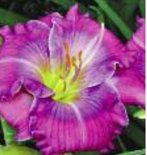
'Lavender Blue Baby (Carpenter-J., 1996) Julie Covington photo