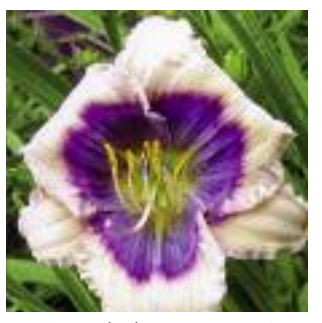
Crystal Blue Persuasion (Salter-E.H., 1996)

that extends over the entire petal and sepal surfaces? Hoping for straightforward answers, I posed this question to several of my plant geneticist colleagues but came away disappointed after learning that there is still much that we don't understand at the level of individual