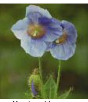
Himalayan blue poppy (Meconopsis grandis)