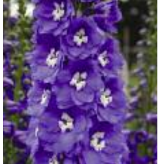
Delphinium elatum 'Royal Aspirations'

restricted to the plant order Caryophyllales (e.g. beetroot, bougainvilleas, and portulacas) and thus can be ignored here, carotenoids and flavonoids are broadly distributed floral pigments. Carotenoids confer