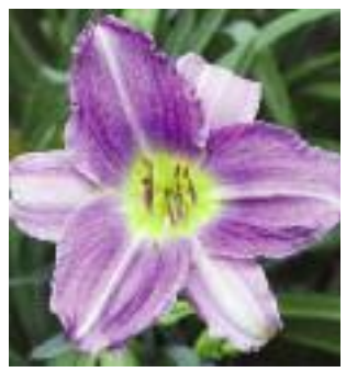
'Prairie Blue Eyes' (Marsh, 1970)