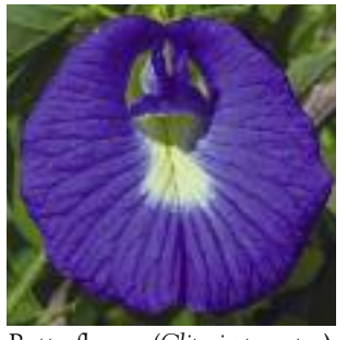
Butterfly pea ( Clitoria ternatea )