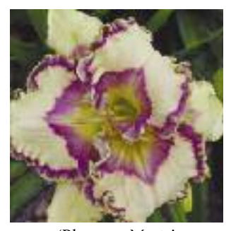
'Bluegrass Music' (Grace-Smith, 2005)