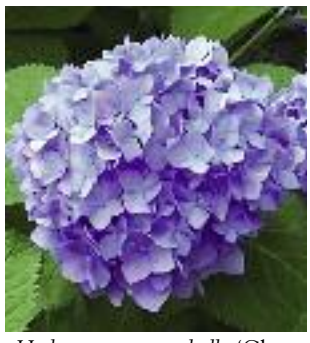
Hydrangea macrophylla 'Glory Blue'