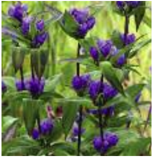
See Blue, page 42