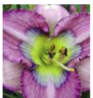
"Piece of Sky' (Moldovan, 2006)

cells. For example, we know little about what regulates pigment production in daylilies and, more specifically, what controls the positioning and width of daylily eyes. Surprisingly, that lack of knowledge made the quest for the Holy Grail of daylilies all the more exciting and caused me to throw my hat in the ring. In fall 2012, I purchased about two dozen blue-faced daylilies as an early Christmas present to myself and, during