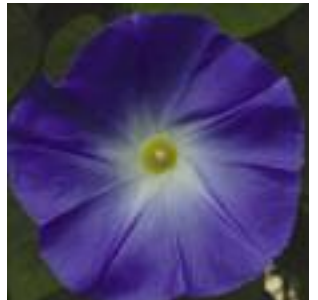
Blue morning glory (Ipomoea tricolor 'Heavenly Blue')

dull purple to that brilliant blue that we all enjoy.