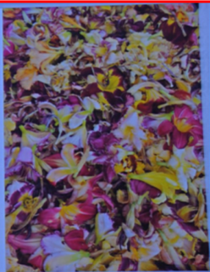
Hybridizing by Shelly