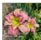
Olivia Juliette (Westhoff, 2023) *

height 36 inches (91 cm), bloom 6 inches (15 cm), season M, Dormant, Diploid, 33 buds, 4 branches, Double 10%, Polymerous 10%, White with large merlot eye and green throat.. (Crystal Spirit × sdlg)