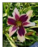
Barb's Brightest Star (Papenhausen-Harroun, 2022)

height 25 inches (64 cm), bloom 3 inches (7 cm), season E, Dormant, Diploid, Fragrant, 18 buds, 3 branches, Double 100%, Light mauve with maroon eyezone and yellow green throat.. (unknown × Sweetest Cherry)