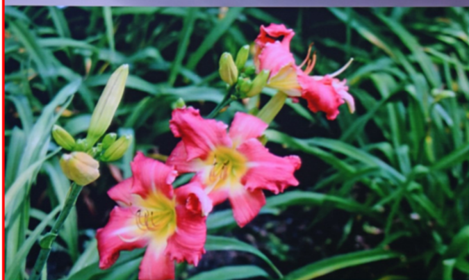
Hybridizing by Barb