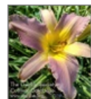
Lavender Lemonade (Kramer, 2023) *

height 25 inches (64 cm), bloom 5 inches (12 cm), season EM, Rebloom, Dormant, Diploid, Fragrant, 17 buds, 3 branches, Double 99%, Layered soft yellow peach with rose eye and small green throat, fertile both ways.. (Siloam Double Classic × Condilla)