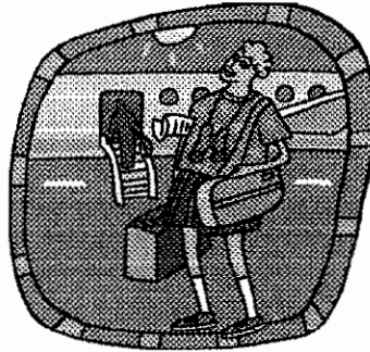
She who dies with the most daylilies, wins.

We were up bright and early the next morning for the short drive to Jeffcoat's. The main display beds were near Peg and Jim's home, on the inside perimeter of a fenced area, with a gazebo surrounded by beds. Jean took note of some newly planted introductions of Jamie Gosard's, and we wished they were closer to blooming. Across the road, visitors were treated to the longest continuous beds of daylilies you can imagine, lined out plants that kept going and going and going