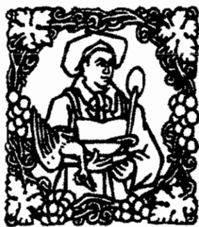
Autumn banquet plans are simmering.