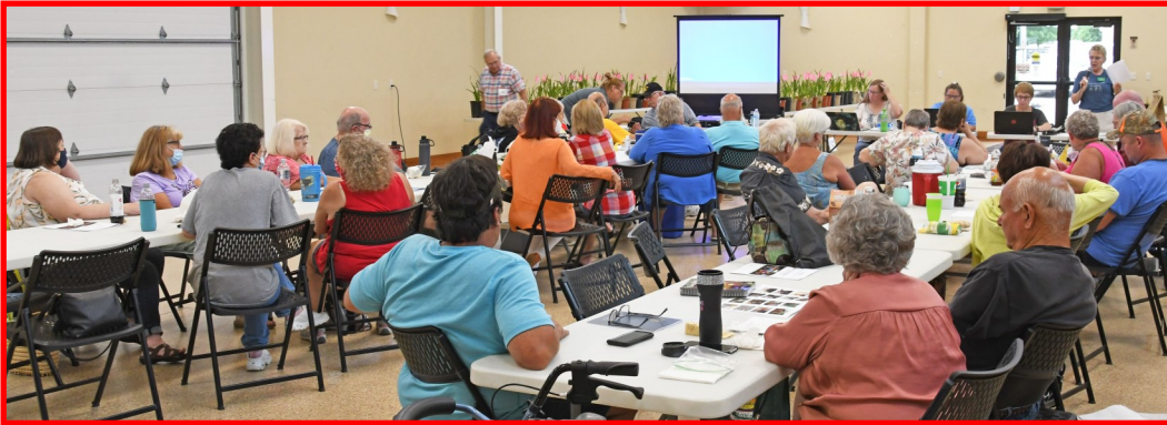
“Now It’s Time to Get Serious” .... Bidders !!!