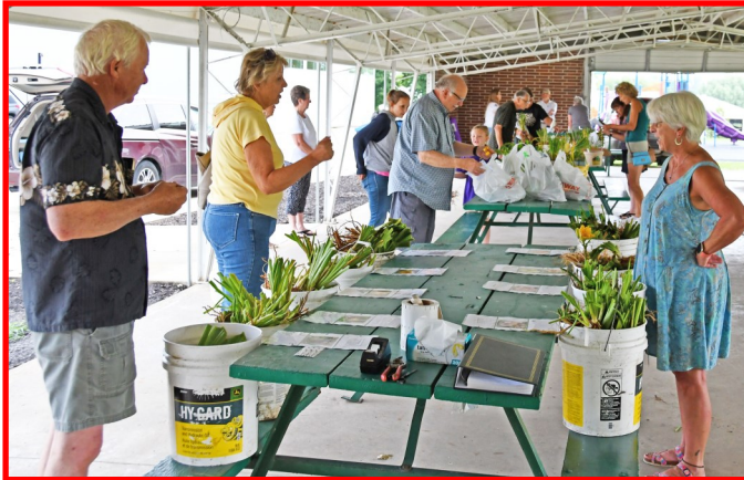
And Then There Were Plants