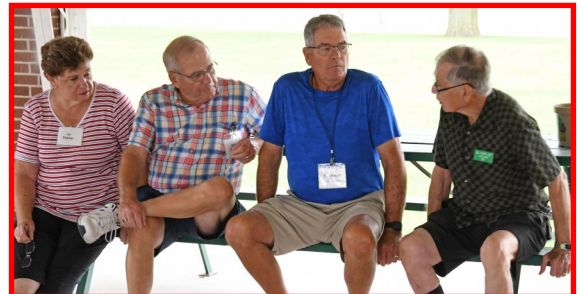
While the Board of Trustees .....