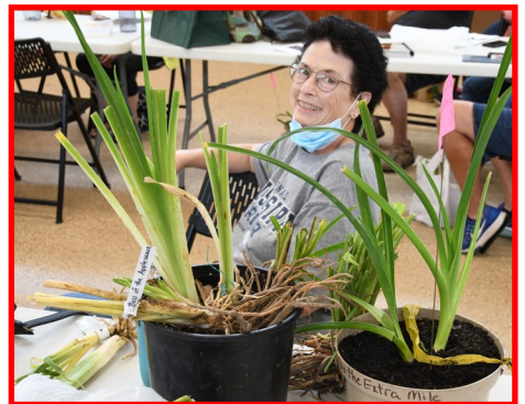
You’ve Got to Get Up Pretty Early In the Morning to Out-Bid This Girl !!!