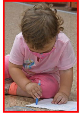
“I’ve Just About Got My Bid Ready”