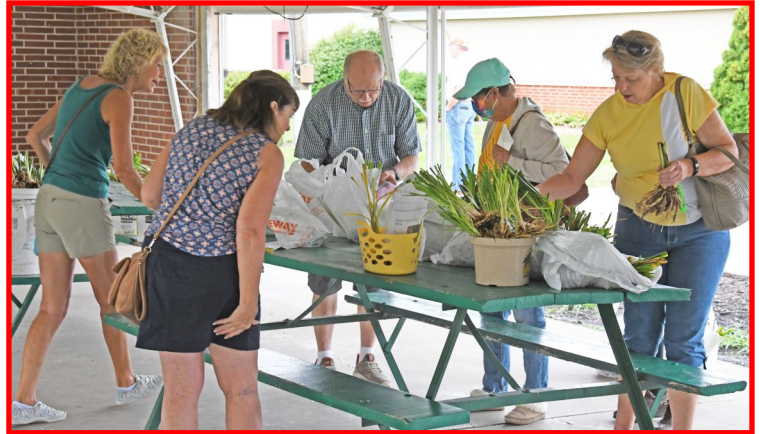
And Then There Were Shoppers