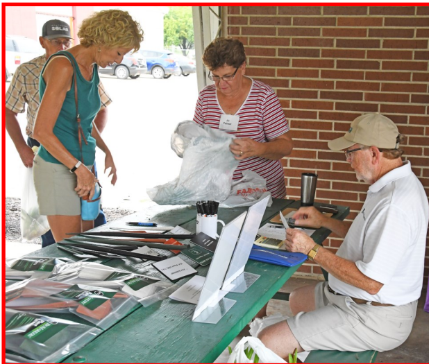
And Then There Were Buyers