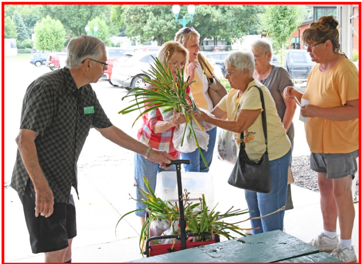
And Then There Were More Plants